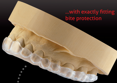
...with exactly fitting bite protection